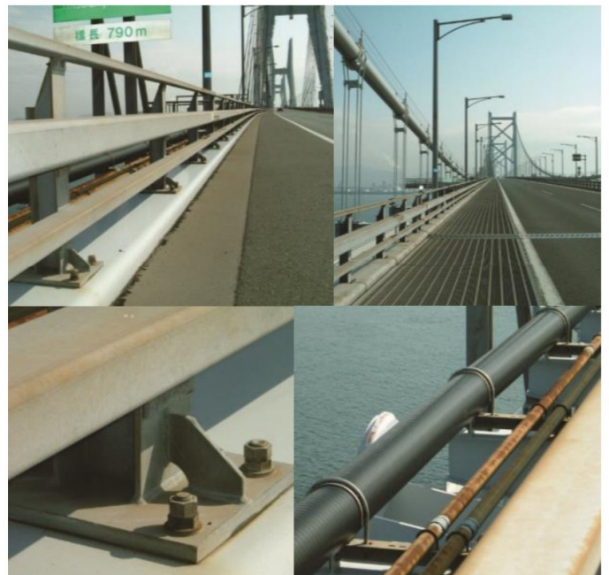
Long-span Bridge Road Equipment