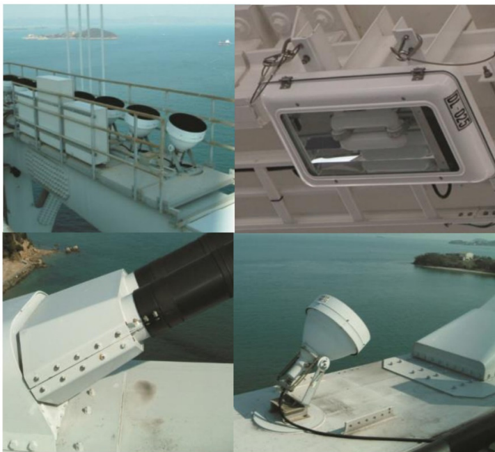
Long-span Bridge Ancillary Equipment Joint