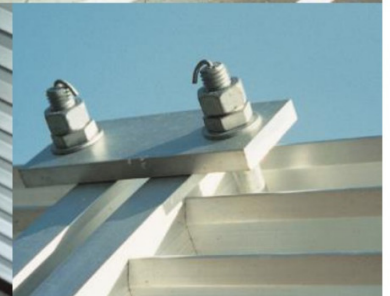
Aluminum Highway Fence (Second Tomei Expressway)