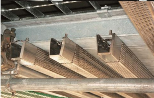
Sound – Absorbing Panels