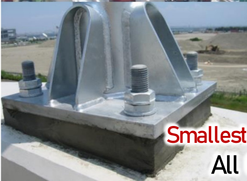
Lighting Columns Anchor Portion (Metropolitan Expressway)