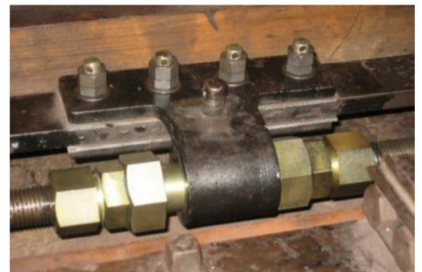
Switch Adjuster of Point