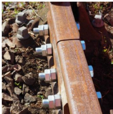
Fishplate Bolt (in the UK)