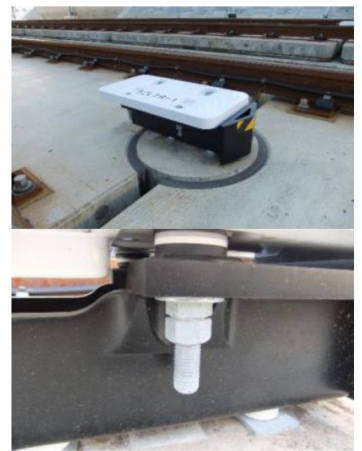
Automatic Train Stop (ATS)