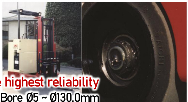
Wheel Axis Stopper

Smallest parts that require highest reliability All Grades & Surface Treatment | Bore Ø5 ~ Ø130.0mm