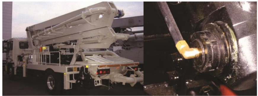
Concrete Pump Truck