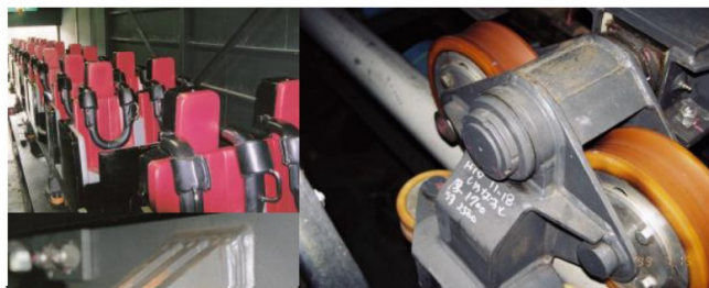
Roller Coaster Guide Roller